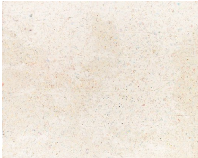
Howardena Pindell, Carnival at Ostend, 1977.

Finally, in this exhibition and surrounding research, I want to suggest a small way to recuperate documentary. After many years of programming and writing about moving image art, especially in the experimental documentary realm, I have been thinking about how we can make steps towards repairing documentary media's association with form. It's important here to remember that documentary was an art form before it became an extension of ethnography, or was later bound up with the goal of creating impact for its subjects and audience. John Grierson, who coined the term documentary in the 1920s, defined it as the “creative treatment of actuality,” that is, a form of art dealing in the real. My research furthermore attempts to think of documentary as a practice in art, separate from documentation; separate from the interpassive, faux democratic terms of popular contemporary nonfiction brought about by the mainstream documentary industry and rise of the “social issue doc.” 1