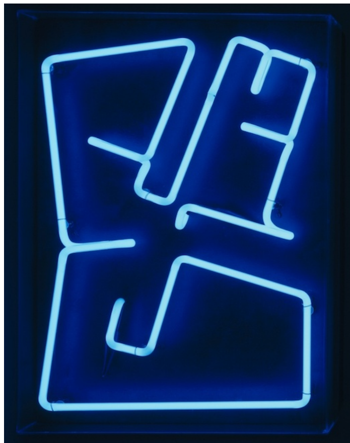
Gyula Kosice, Estructura lumínica Madí 6 (Luminescent Madí Structure No.6), 1946. The Museum of Fine Arts, Houston.

This research splits into a few historical points regarding abstraction. The first is that the Modern art historical construction of abstraction (via Clement Greenberg et al) ignored a centuries-long history of abstract and formalist practices from around the world. It also disregarded Modern abstract artists’ own acknowledgement of visual and contextual references outside of their field. And then finally, there has been an ongoing tradition of Modern and contemporary abstraction from around the world that operates upon or engages with coextensive lived existence. To illustrate this last point, a line can be drawn through examples from early Modern art to the present. Malevich’s obstructionist abstractions heralded the post-revolutionary Bolshevik government through avant-garde tactics. 1